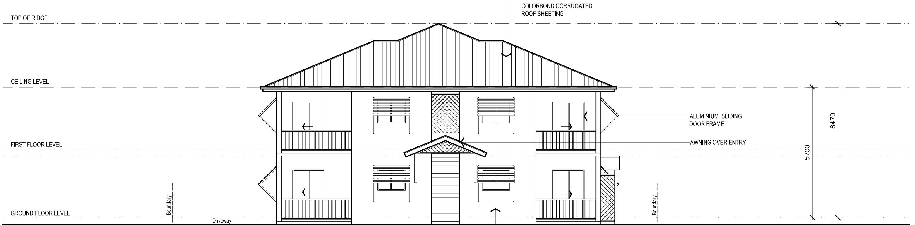
ELEVATION A SCALE: 1:100