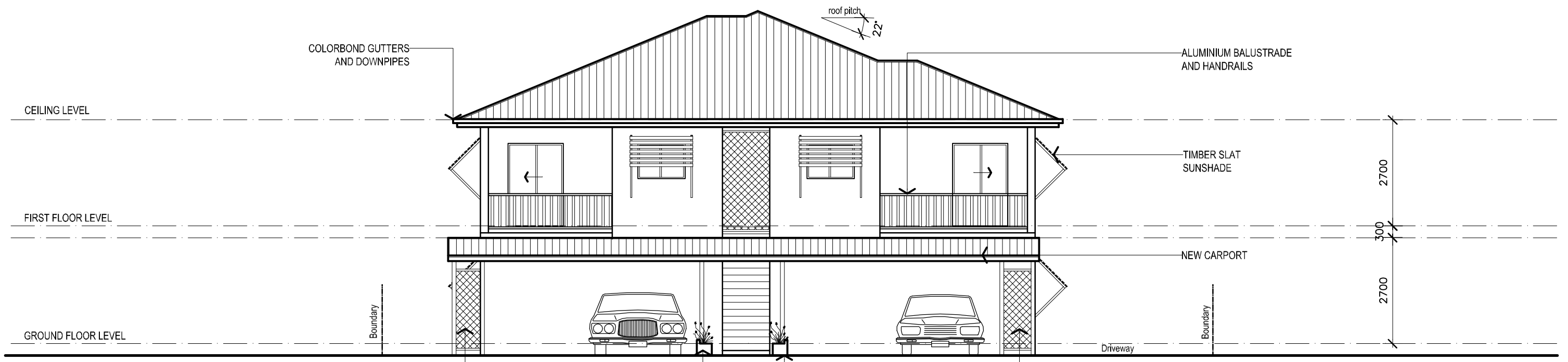
ELEVATION B SCALE: 1:100